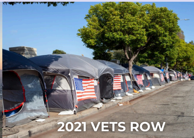
2021 VETS ROW